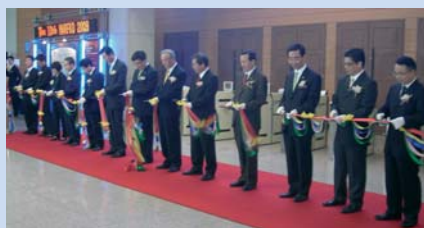
The opening ceremony

■ was held at Kintex in Koyang City, near Seoul, South Korea, on March 18-21, 2009. 20 000 visitors discovered a broad range of products on 176 stands. Thanks to KRAIA (Korea Refrigeration and Air conditioning Association), the IIR ran a stand throughout the show. The Korean National Committee for the IIR staged the Third Korean Congress of Refrigeration in conjunction with HARFKO: 32 papers were presented. www.harfko.com www.kraia.or.kr