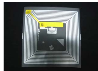
Figure 2. An RFID tag.