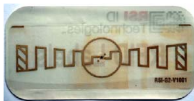
Figure 3. An RFID tag.

There is no shortage of published examples of RFID applications in the food and pharmaceutical industries. However, it is difficult to discern from the information publicly available which trials have evolved from pilot studies into full commercial implementations. Furthermore, updated information about the outcomes of past commercial pilot trials is sensitive and mostly unavailable to the general public.