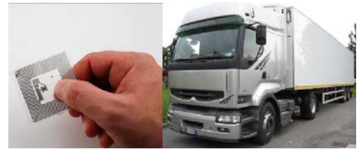
Figure 4. One of the objectives of the "CHILL-ON" project, an European initiative, is the development of a tracking system that integrates RFID and TTI principles. This hybrid technology has significant potential to enhance safety and quality in food supply chains.

(d) Temperature sensors integrated to RFID tags require continuous power, which is usually supplied by the battery on the tag. The extra power required not only significantly increases the cost of the hardware and makes it heavy and bulky, but also limits a tag's lifetime. Researchers at the Auto-ID Lab (St. Gallen, Switzerland) have proposed an ambient energy scavenging system as a method to power sensors on battery-free RFID tags for continuous temperature monitoring. Work on this innovation continues. 23